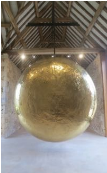
Subodh Gupta, “Touch, Trace, Taste, Truth” (2015)

The second room has a wonderful, carved, white marble “wardrobe” with a latticed front, through which you can see what appears to be a waterfall, but on closer inspection is a digital projection and in the next